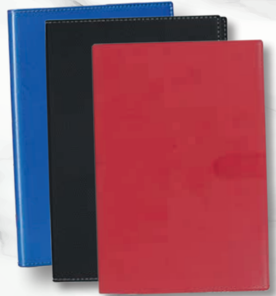
Refillable covers, an eco-friendly solution.