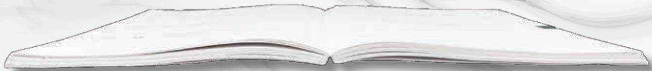
180-degree lay-flat sewn binding