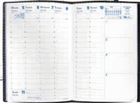
- 4 x 6" (10 x 15 CM)