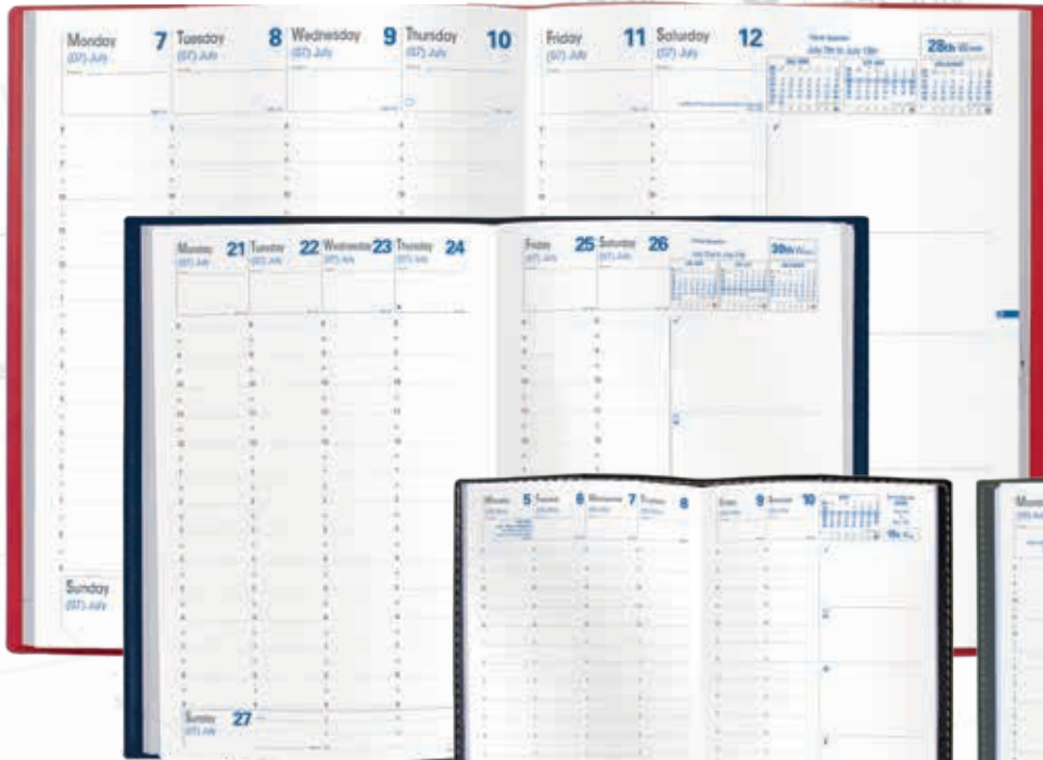
PRESIDENT - 8 1/4 x 10 1/2" (21 x 27 CM)