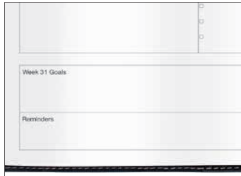
Reminders / Goals