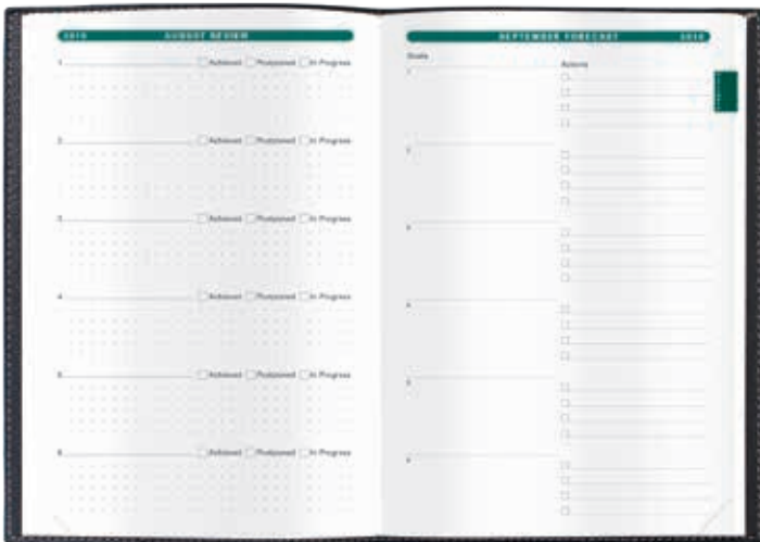
Review & Forecast each month