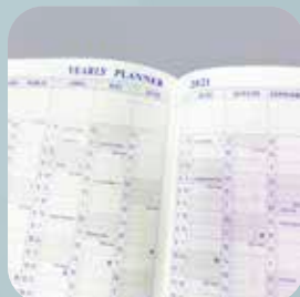
Annual planning pages