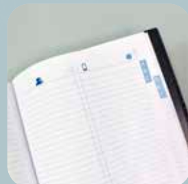
Attached address book