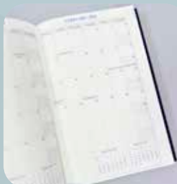
Monthly planning pages