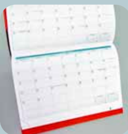
Monthly planning pages