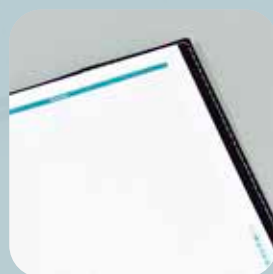
Extra notes pages