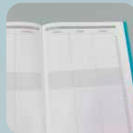
Time + Schedule