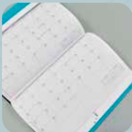
Monthly planning pages