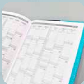
Annual planning pages