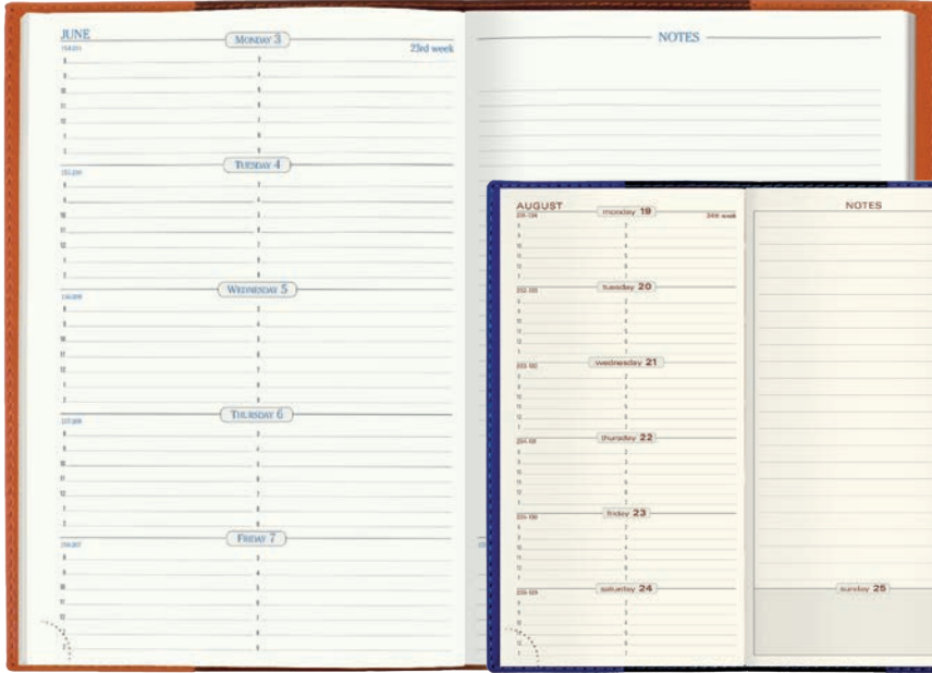
SPACE 24 - 6 1/4" x 9 3/8" (16 x 24 cm)

All three planners feature daily AM to PM schedules and the week on the left, but the Space 17 has more space for freeform notes and Sundays on the right. The IB Traveler has designated spaces for priorities, as well as a monthly calendar at the top of the spread, while Space 24 has three monthly calendars below the notes section.