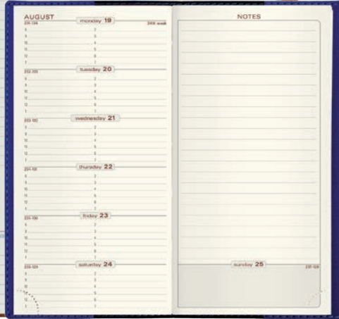
SPACE 17 - 3 1/2" x 6 3/4" (8.8 x 17 cm)