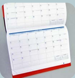
Monthly planning pages