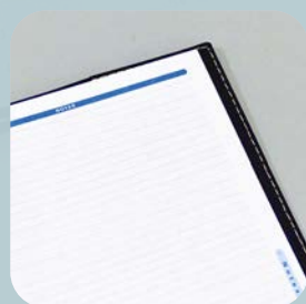
Extra notes pages