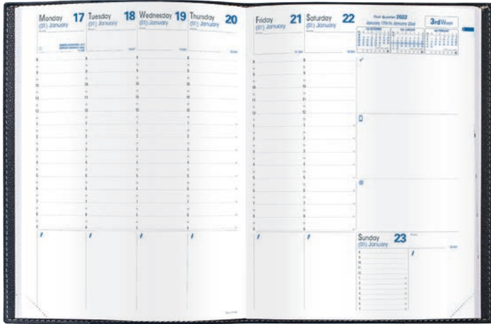
TRINOTE - 7" x 9 3/8" (18 x 24 cm)

Both the Trinote and Prenote planners include helpful features such as added space for notes, annual planning pages, and receipts and payments pages, but the Trinote is smaller.