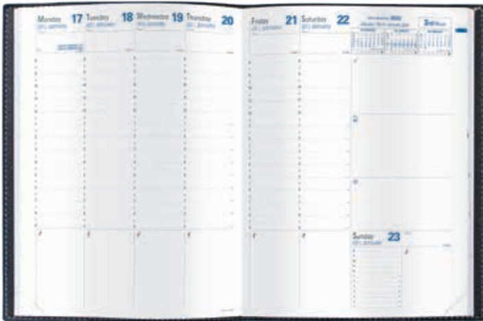
TRINOTE - 7" x 9 3/8" (18 x 24 cm)

Both the Trinote and Prenote planners include helpful features such as added space for notes, annual planning pages, and receipts and payments pages, but the Trinote is smaller.