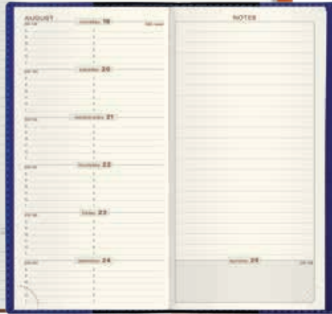
SPACE 17 - 3 1/2" x 6 3/4" (8.8 x 17 cm)