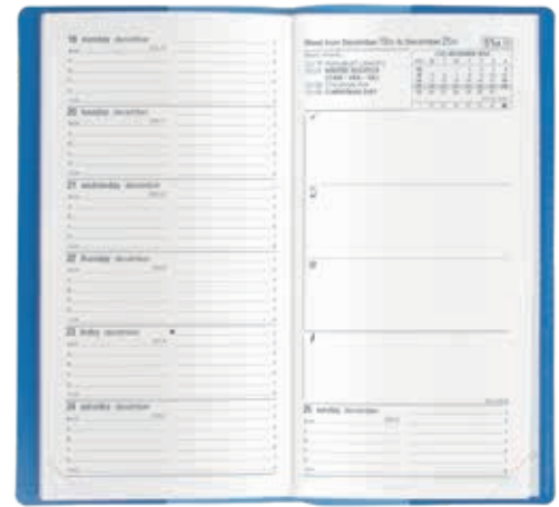
IB TRAVELER - 3 1/2" x 6 3/4" (8.8 x 17 cm)